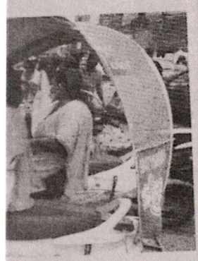
ട്രെട്ടാത്തുക യുടങ്ങിയ ആവശിങ്ങൾ